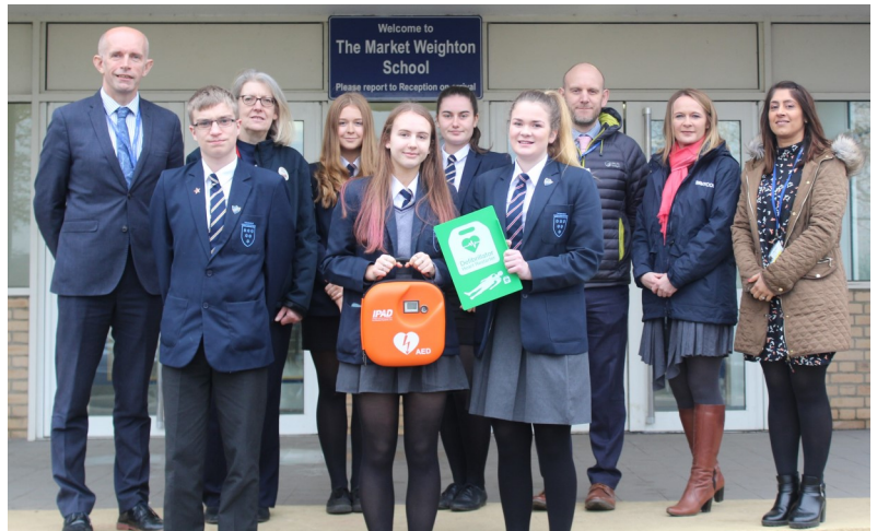
Senior students receiving a defibrillator after Year 11 students were inspired to raise funds to give something back to the school

We also need nominations for House Captains, an organisation role for inter house sport competitions and member of the student sports council. Both posts are open to all students.