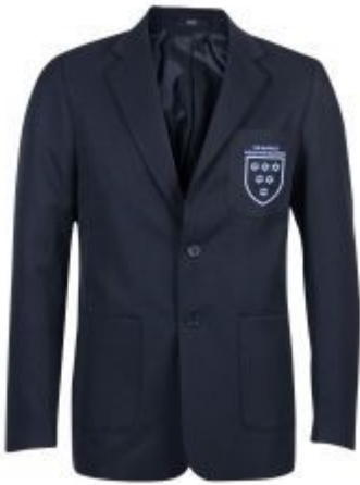
** BOYS TMWS BLAZER