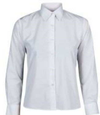
* GIRLS LONG/SHORT SLEEVE SHIRT

*THESE ITEMS ARE COMPULSORY BUT CAN BE PURCHASED FROM ANY STORE