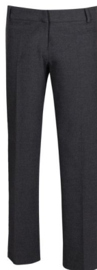
* GIRLS TROUSERS