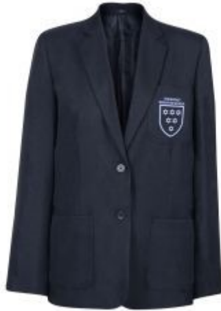
** GIRLS TMWS BLAZER