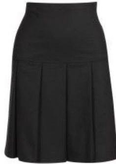
** PLEATED SKIRT