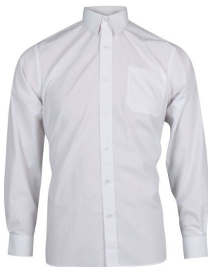
* BOYS LONG/SHORT SLEEVE SHIRT