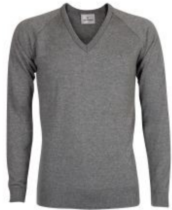
*** GREY V NECK JUMPER